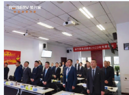
2023 Annual Debriefing Meeting