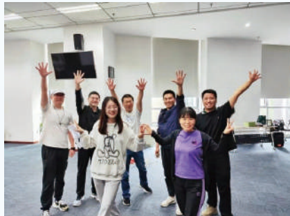
“Embracing Beautiful Life and Enjoying the Fun” Activity