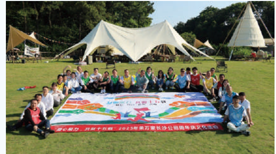
Team Building Activities