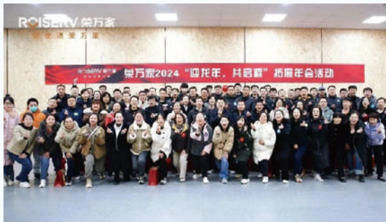
Team Building Activities at the Annual Meeting

The Group actively organises employee activities, including traditional festival celebrations, team building, corporate culture building, welfare and care, to enrich the employees' leisure time.